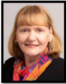
Stephanie A. Urchick RI President